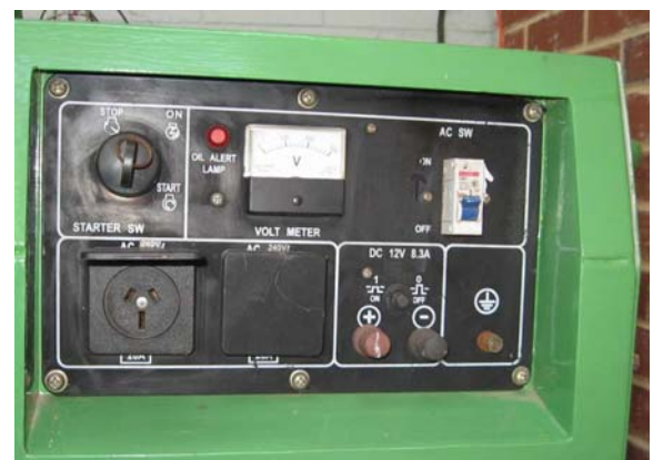
5 kW Diesel generator running on biodiesel